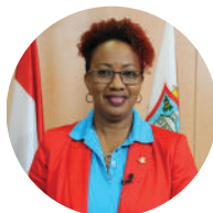
Hon. Silveria E. Jacobs Prime Minister, St. Maarten