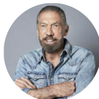
John Paul DeJoria Entrepreneur and Philanthropist, Co-Founder, Paul Mitchell Systems and Co-Founder, Patron Spirits International